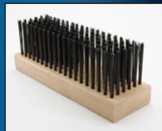
Fine Bristle Brush Head